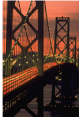
Building bridges within the Church of Ireland

Welcoming everyone seeking change in the church's understanding of human sexuality.